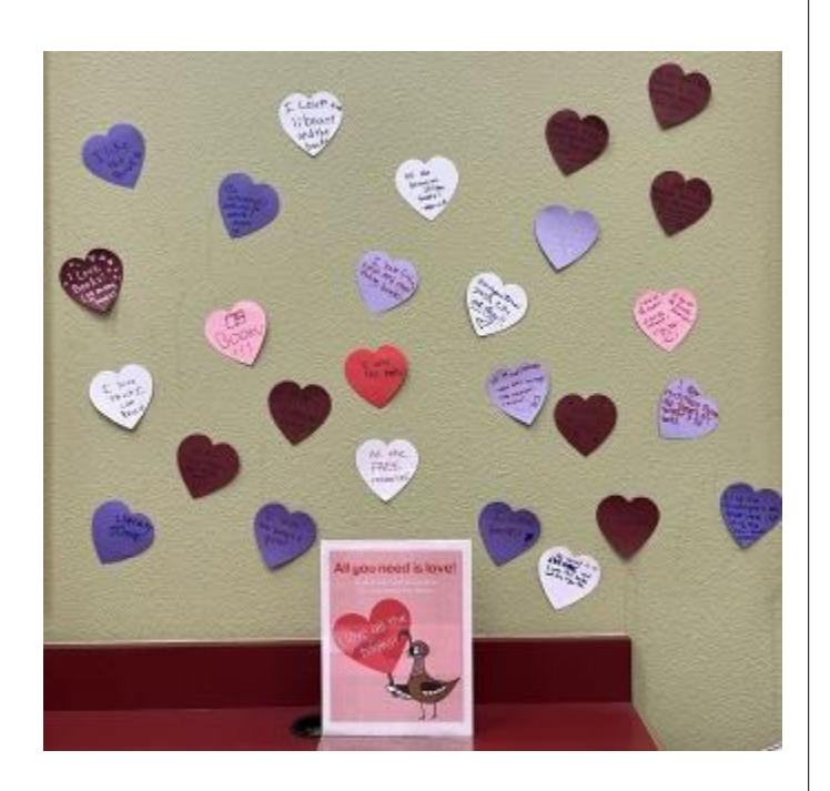
Youth Library Craft