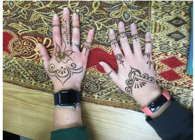
Hands Decorated with Henna