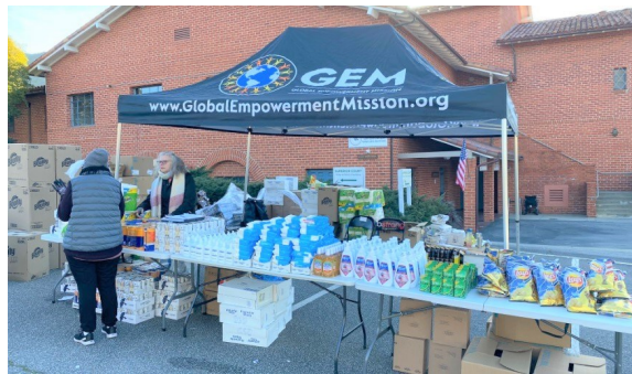
County Library staff distributing essentials

During January and February of 2023, the County of San Luis Obispo Public Library staff went outside of the Arroyo Grande Library to help with the County's FEMA flood relief programs. Our Library staff helped folks that were impacted by the heavy winter rains in Avila Beach, Oceano, San Luis Obispo, Morro Bay, Los Osos, Templeton, Santa Margarita, Paso Robles and beyond. Staff distributed packages of food and other essentials, helped with storm debris collection, and helped staff the disaster recovery center.