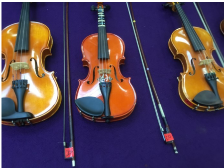
Some instruments in the Petting Zoo

We are ever grateful for the support of the Arroyo Grande Friends of the Library.